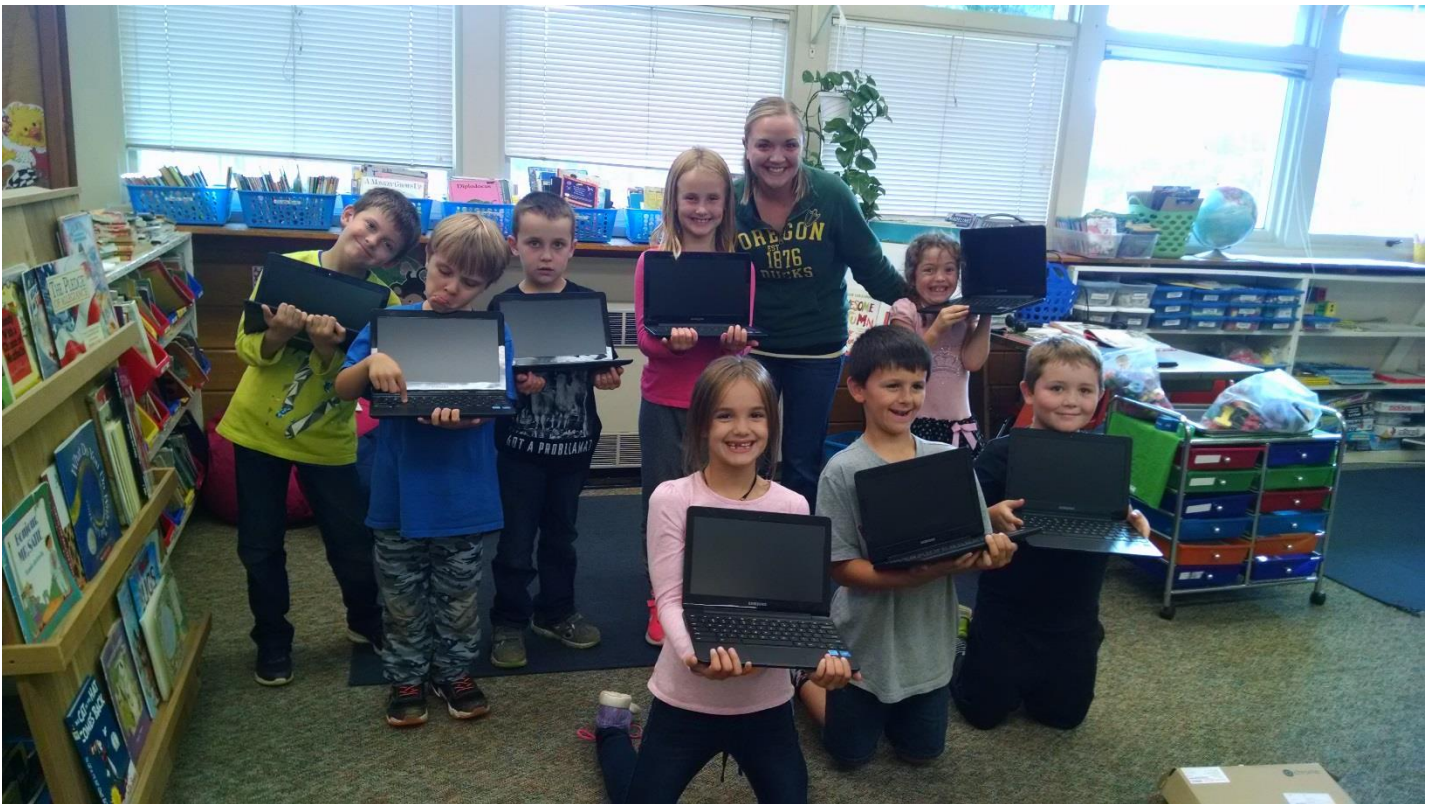
2 nd grade class with their new Chrome books.